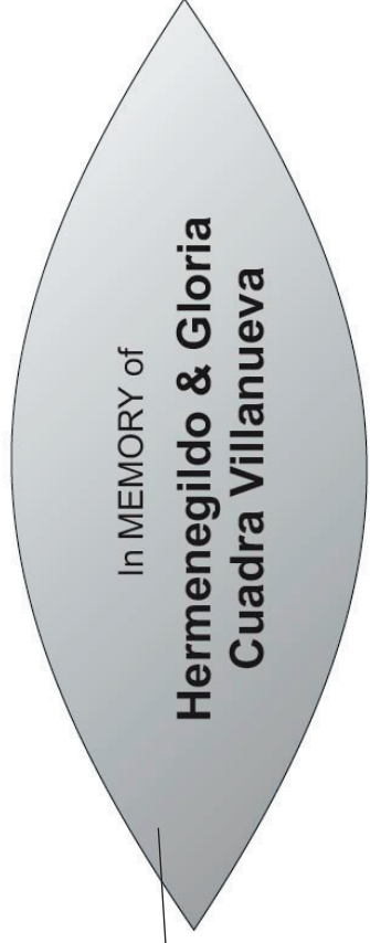
A sample inscription on a leaf.

Indicate how you want to be listed in the alphabetized list of donors in the Interactive Screen ( Example: Smith, John & Mary )